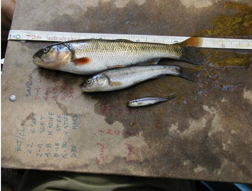
Figure 3 Restoration is improving habitat for fish like these found in Deckers Creek

In this study, average WTP for full creek restoration ranged between $12 (non-anglers) and $16 (anglers) per household per month. Adding these benefits across the watershed population yielded benefits totaling $1.9 million. Restoration of Richard Mine alone would improve two of three creek attributes—aquatic life and scenic values—but not primary-contact recreation or odor. 14