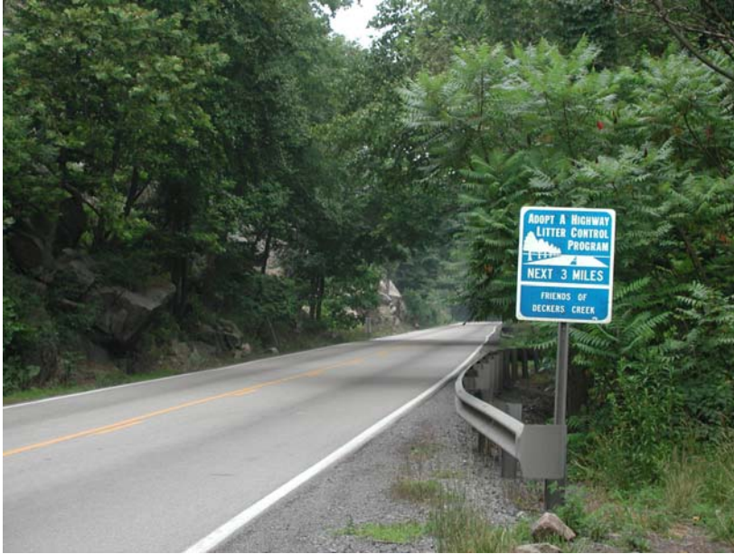
Figure 2 Friends of Deckers Creek cleans up trash along the creekside Old Route 7 Scenic Byway