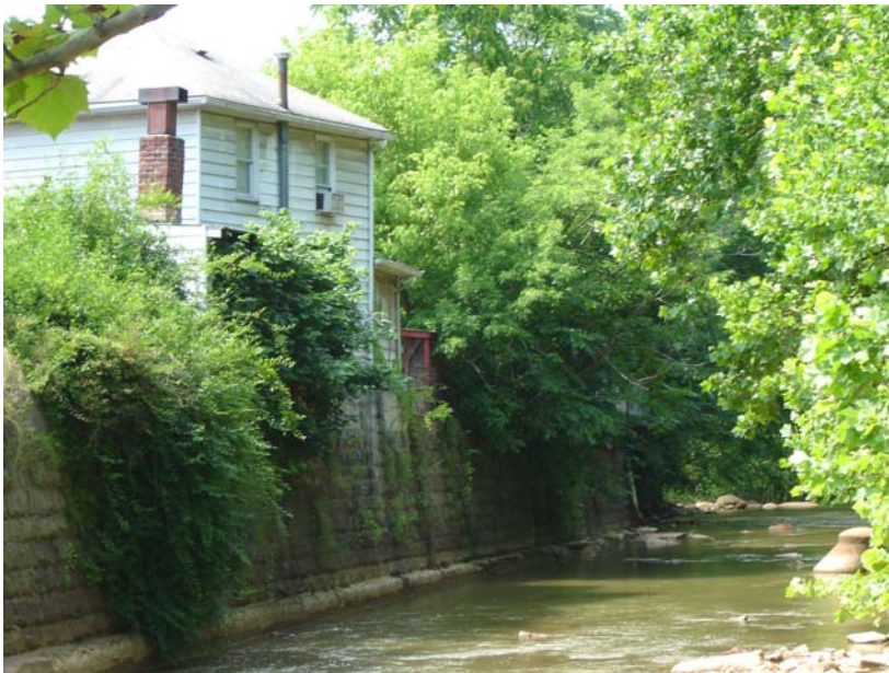
Figure 4: Brockway Avenue home along Deckers Creek that suffers from bacteria-related odors and health threats