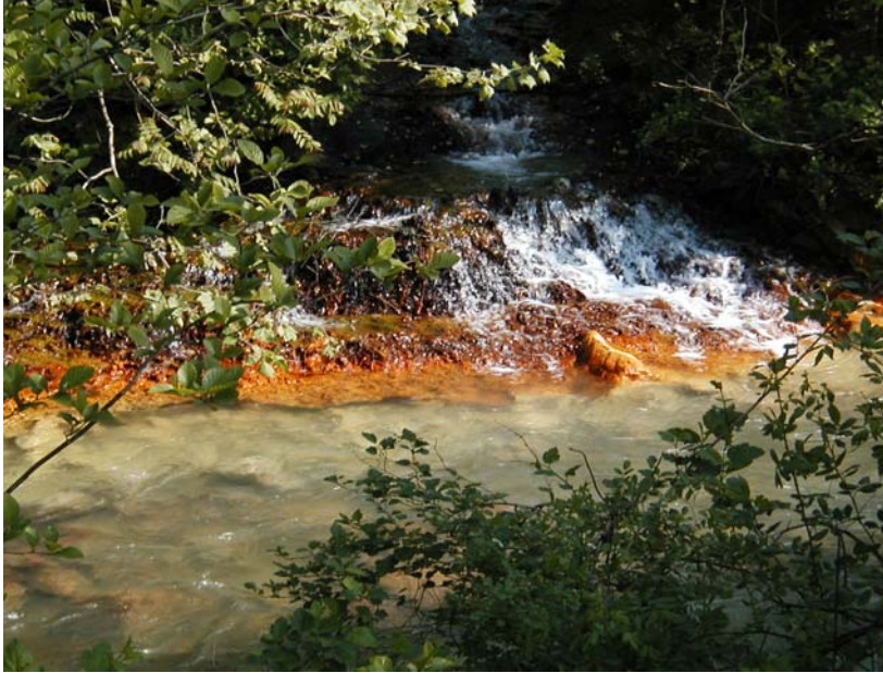
Figure 1 The Richard Mine discharges 200 gallons per minute of acid mine drainage directly into Deckers Creek

locally. Income compensation would account for $36,307 of this and the generation of 0.8 years of employment could be expected for each year of O&M. 11 If this funding comes from local sources, it should be considered a cost and compared with benefits forgone (opportunity costs) from alternative use of the funds.